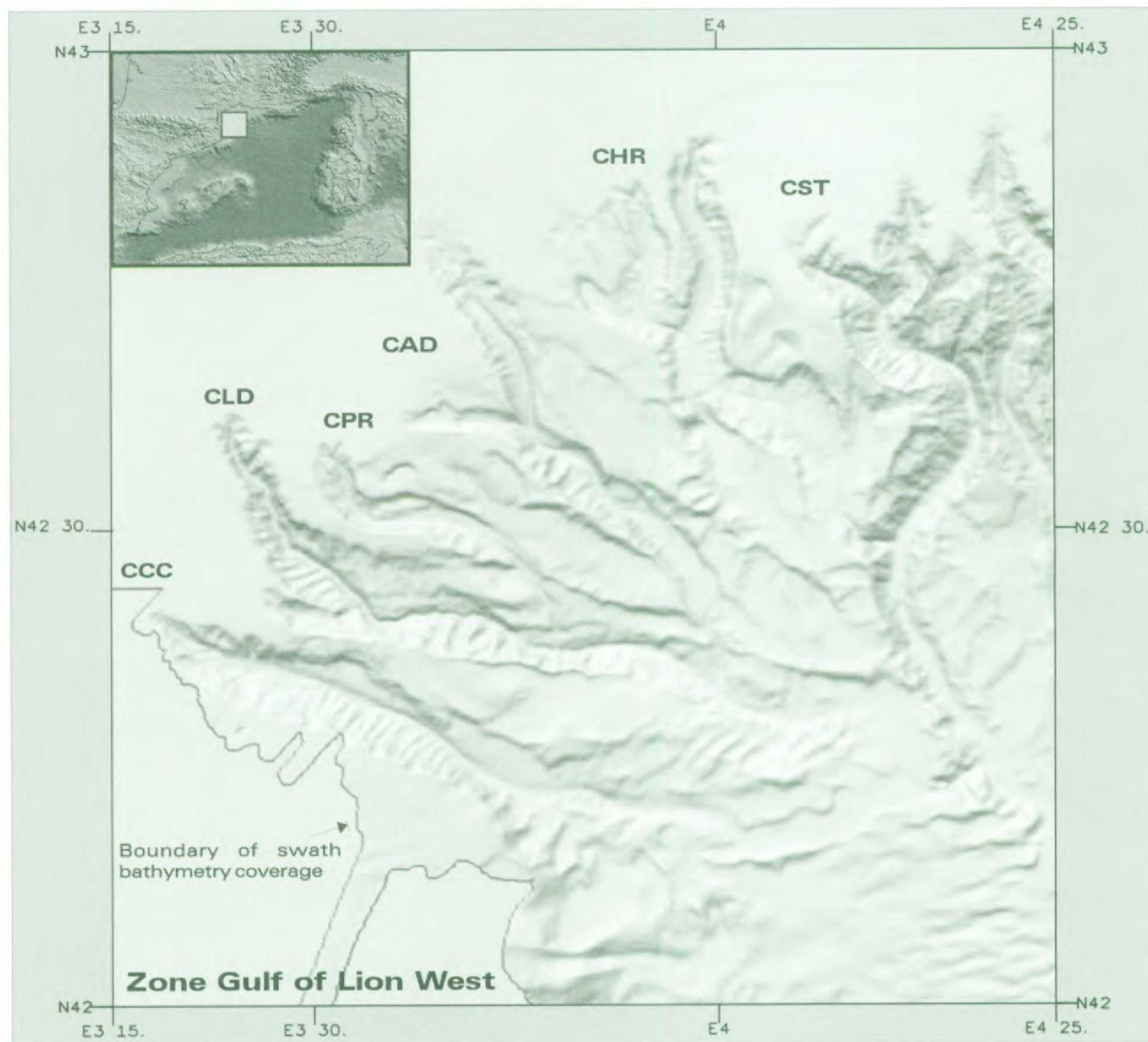
Fig. 1: Canyons system of the Western Gulf of Lions. The outer shelf is incised by the canyon heads, indicated by labels in capital letters. The lower slope is to the right lower corner of the image. The Cape of Creus (CCC) and the Lacaze-Duthiers (CLD) canyons merge in the lower slope prior to tribute into the Sete Canyon (CST). The Pruvost (CPR) and Aude (CAD) canyon are tributaries of the Lacaze-Duthiers Canyon. The Hérault Canyon enters the Sete Canyon at its mid-course. The western canyons, from CCC to CHR, tribute into the Sete Canyon as hanging valleys. Note the axial incision and the gullied walls of the upper and mid courses of all the canyons. Some large landslide scars can be also observed, as well as retrogressive incisions on the western flank of the Sete Canyon.