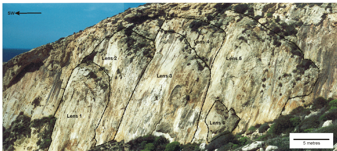
Figure 1 Lenses of fault rock adjacent to a bend on the Maghlaq fault, Malta. This fault has an estimated vertical displacement of ca 200m and is characterised by frequent segments and associated breached relays and bends.

Outcrop observations therefore suggest that the evolution of segmented fault arrays within limestones tends to provide linear zones of enhanced vertical permeability at pre-existing segment boundaries. This view is supported by high quality 3-D data from the Lisheen Mine, in the Irish Midlands, for which ore distributions also provide constraints on fault-related fluid flow (Carboni et al. 2003). Mineralization occurs as post-faulting replacements of Courceyan-aged carbonates, forming stratiform lenses at the base of a regionally dolomitised limestone. The main ore bodies are bounded to the SE by three en-échelon, north-dipping normal fault segments (Fig. 2) with maximum throws of ca. 220 metres, linked by intact relay ramps (up to 500m wide). However, smaller-scale fault segmentation has resulted in a series of breached relay zones (up to 150m wide) similar in character to those seen in Malta. Ore thickness and grade distribution patterns indicate that these strongly deformed breached relays, and related branch-lines and bends, were ‘feeder’ structures acting as the locus of upward flow along the main faults; outwith of these breached relays there is little evidence of focused flow of ore fluids along the bounding faults.