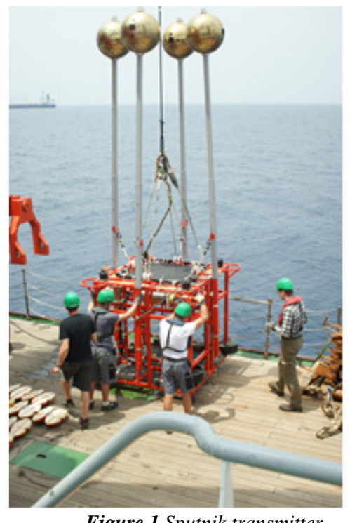
Figure 1 Sputnik transmitter frame.

The Sputnik TX system was successfully used in three CSEM experiments targeting shallow gas hydrates (2012: M87/2, R/V Meteor, Norwegian Shelf / Storegga Slide; 2013: SO227, R/V Sonne, passive and active margin to the SW of Taiwan; 2014: MSM35/2, R/V M.S.Merian, Danube Delta / Black Sea).